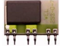
Above: Software controlled fuse

To overcome this potential problem each power channel is protected by a Welwyn Switch Disconnect component and the system is scanned continuously by the control software. If a short circuit fault is detected a signal is generated which activates the Switch Disconnect and opens the fuse element, isolating and protecting the heater panel. The control system has several degrees of redundancy built in so that the heaters will continue to operate with one channel isolated. Using this system any subsequent repairs required are only to the electronics and not to the airframe.